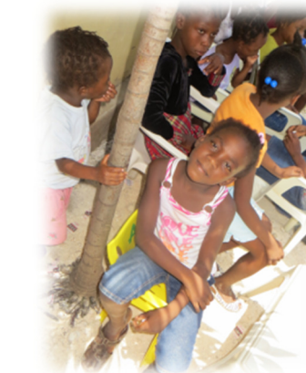
Kids are fun anywhere