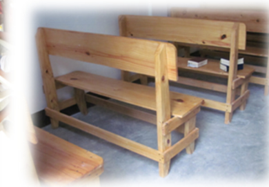
Furniture built by VoTech Students