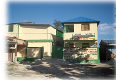
St. Charles Clinic