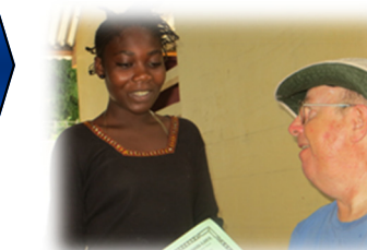
Encouragement from a great report card