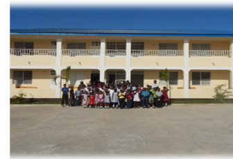
New NDC Orphanage & Kids